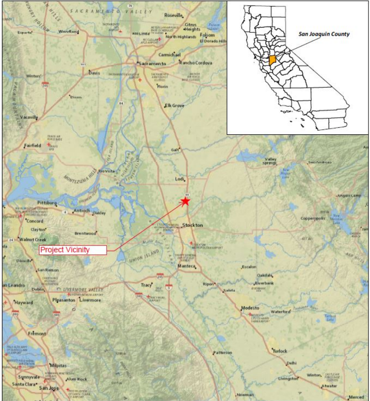
1) General Vicinity map