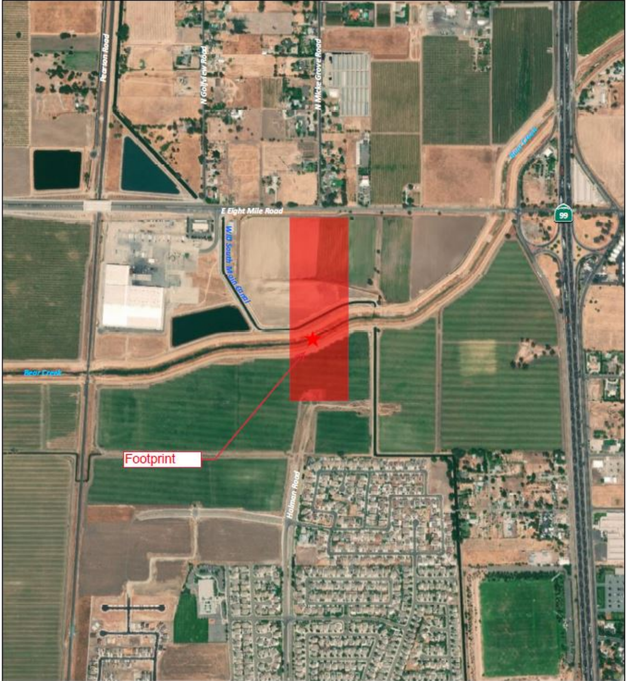
3) Proposed Footprint map